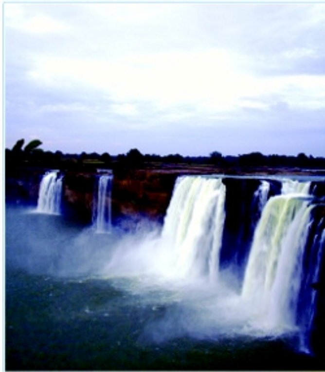
Chitrakoot Water Fall, Jagdalpur, Chhattisgarh