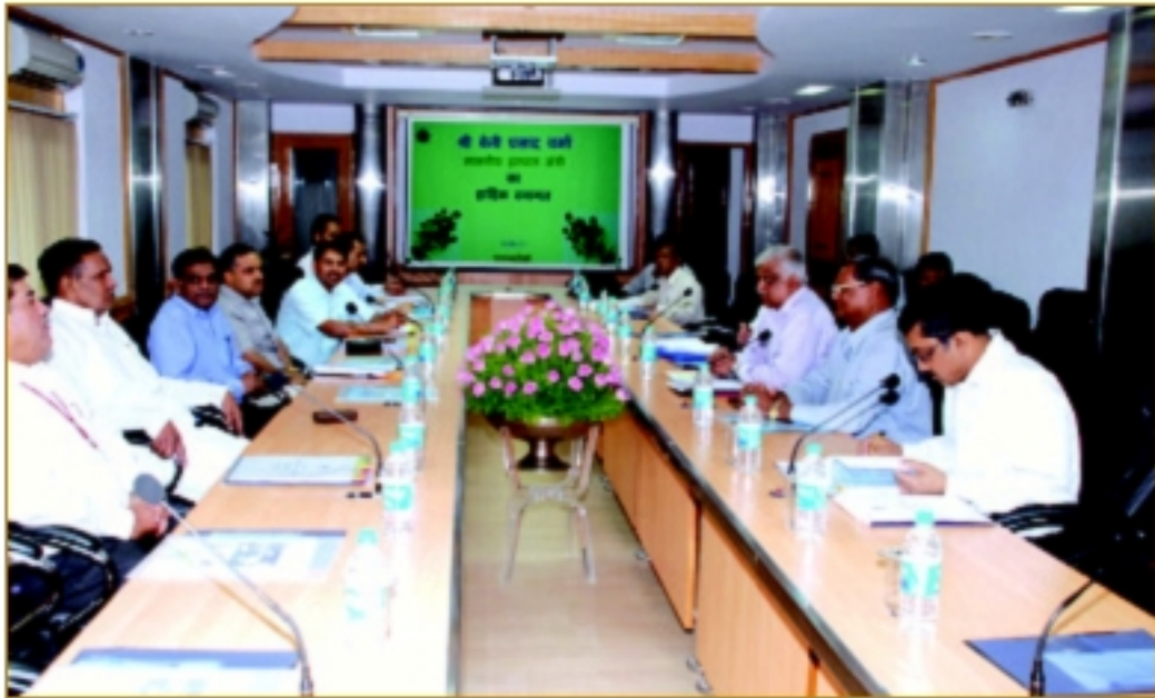
Shri Beni Prasad Verma, Hon'ble Union Minister of Steel reviewing the performance of NMDC for the year 2010-11.