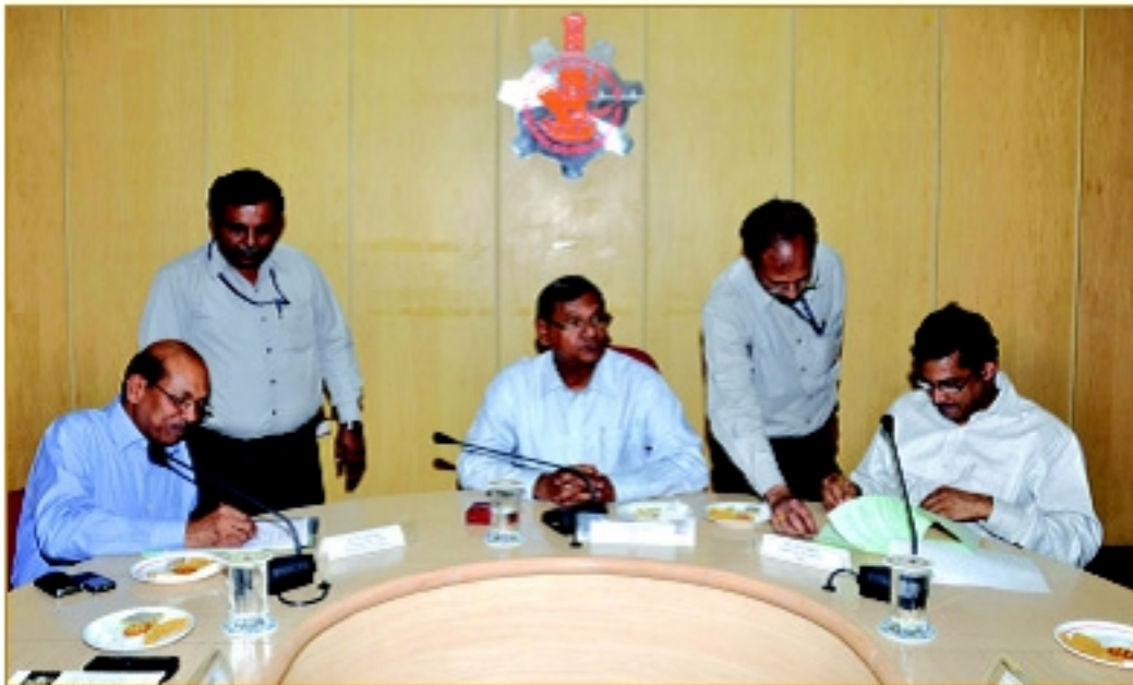
NMDC signed the contract for setting up the country's largest blast furnace of 4506 cubic metre for its 3.0 MTPA steel plant at Nagarnar, Chhattisgarh.